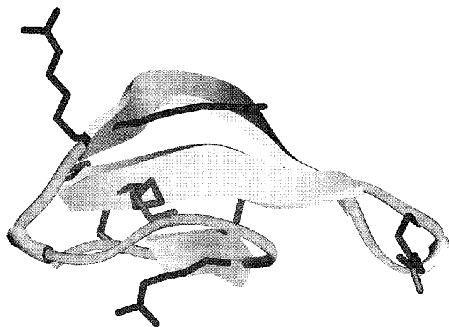
FIG. 1. Molecular model of a defensin, human neutrophil peptide (HNP-1), based on the two-dimensional nuclear magnetic resonance-derived structure. The ribbon structures are \beta -strands connected by tubes of \beta -turn and random structures and stabilized by three intrachain disulfide bridges. The side chains of the positively charged lysine residues are shown as extended Y-shaped structures.

\beta -defensins will have a similar structure. In mammals, the classical defensins are present primarily within neutrophils and Paneth cells, and the \beta -defensins are isolated from epithelial cells, neutrophils, and leukocytes. Defensins are also found in the fat body in insects and the seeds of plants (8, 10). They have a range of activities, and mammalian defensins have activities against bacteria, fungi, and viruses (16). The proteolytic degradation of cationic proteins is thought also to contribute to the formation of antimicrobial peptides. Antimicrobial regions on lactoferrin (a protein with a primary function as an iron carrier) have been liberated upon gastric pepsin digestion of lactoferrin, and an 11-amino-acid peptide in human lactoferrin has been shown to be responsible for its antimicrobial activity (34). In these cases, the antimicrobial region may play a role in bacterial killing, both within the whole protein and as a more potent free peptide. Lactoferrin is currently being used as a nutritional supplement, which can liberate active peptides upon gastric digestion. It is able to reach the lower gastrointestinal tract, where it exerts its effect (whereas oral administration of peptides by themselves would probably result in peptide degradation, thus rendering the peptide inactive).